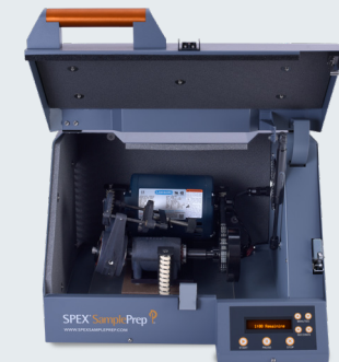
8000M Mixer/Mill® Single-Clamp High-Energy Ball Mill