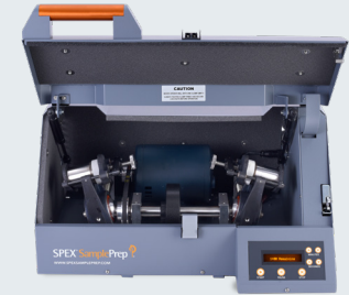
8000D Mixer/Mill® Dual-Clamp High-Energy Ball Mill